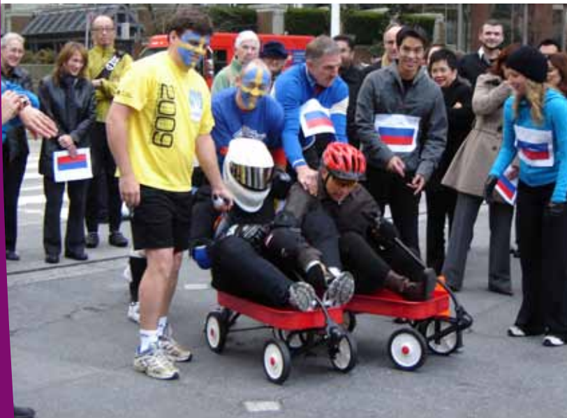
The Fun in Fundraising - a "bobsled" race was part of PH&N's Olympic themed United Way campaign.

PH&N started in Vancouver in 1964, providing straightforward advice and investment counsel to help Canadians invest their assets. Proud of their Vancouver roots, the firm strongly believes in giving back to the community in which they do business. The organization makes an annual financial commitment in support of a variety of charities and encourages employees to add to that support with personal donations through their annual United Way campaign.