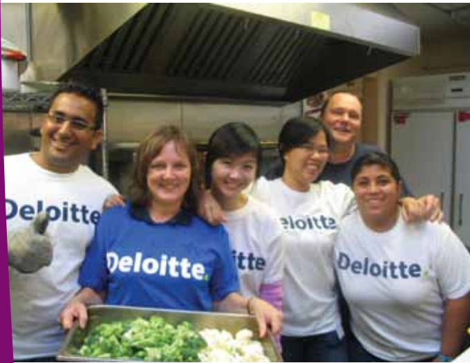
Impact Day at Directions Youth Services Centre.